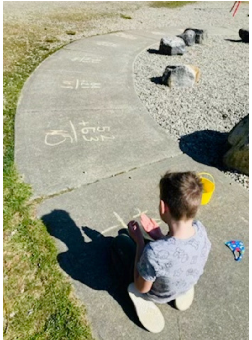
DOUBLE DIGIT ADDITION OUTSIDE!